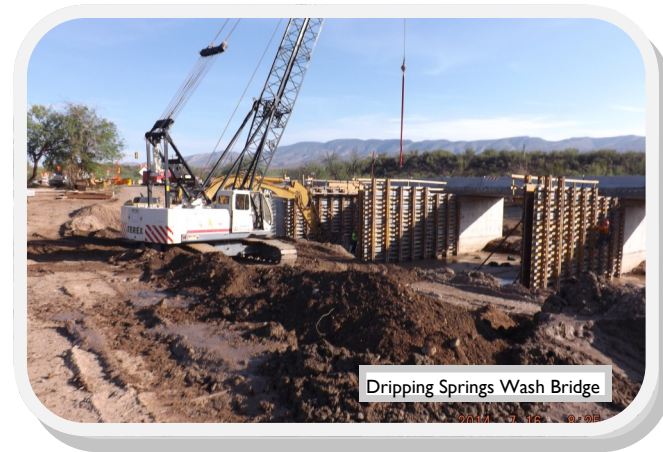
Dripping Springs Wash Bridge